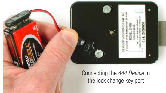
Connecting the 444 Device to the lock change key port