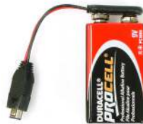
S&G 444 Device with attached 9-volt battery