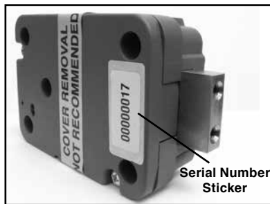
Figure 1 - Serial Number Label

The 8-digit lock serial number is located on a removable sticker on the lock case (See Figure 1.) Which is designed for the security professional in charge of this lock to peel off and place on the proper form. Since you may need the serial number of the lock to reset it if the combination is lost or forgotten and the door is open, it is important that you keep a record of the lock serial number in a secure place.