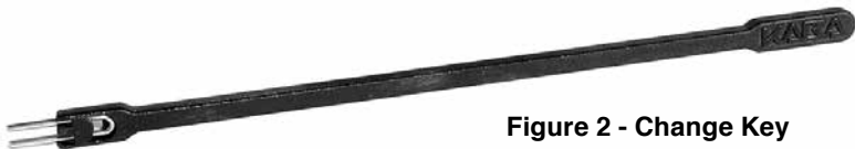
Figure 2 - Change Key